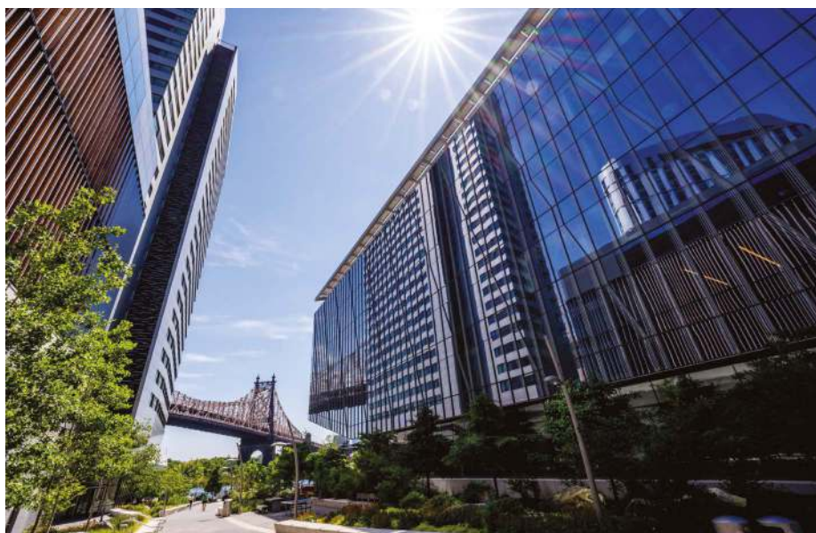
Cornell Tech’s New York campus, the result of a US$100-million drive to attract science investment.